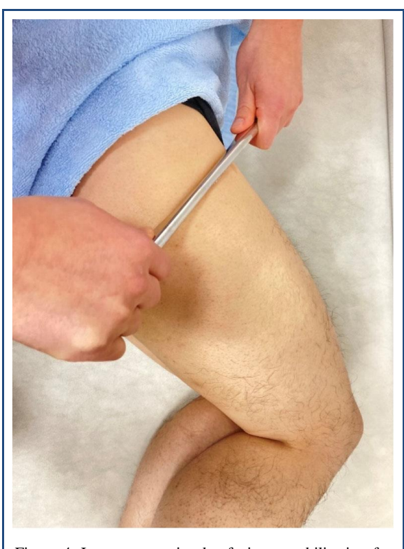
Figure 4. Instrument assisted soft tissue mobilization for tensor fascia lata.

showed no significant difference (Table 2). In the betweengroup comparison, the increase in hip joint adduction ROM was greater for the AS group than for the IASTM group (Table 3).