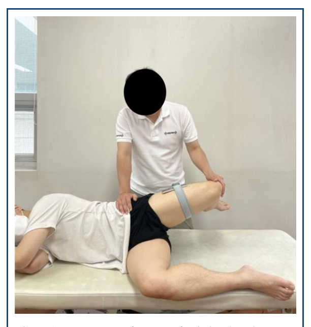
Figure 1. Measurement for tensor fascia lata length.

direction of gravity and then signaled "finish" at the first indication of the movement of the subject's pelvis (Figure 1). The measurement was taken using a smartphone. The endpoint of the Ober test was determined based on the feeling of discomfort or tightness in the TFL. Each leg was subjected to two tests and the mean was recorded. The subjects were given a 1 min rest between each test. Afterwards, the TFL stiffness was immediately measured using the Myoton. The subject was placed in a sidelying position, with their hip and knee joints in flexion. A cushion was placed between the legs to set the hip joint adduction ROM at 0° and the pelvis in a neutral position. The probe of the Myoton was placed in a vertical position on the surface of the soft tissue. The measurement of the TFL was taken at the point 2 cm in the direction of the anterior superior iliac spine from the greater trochanter of the femur (Figure 2). For repeated measurements, the selected point was marked with a pen. The mean of triplicate measurements was ob-